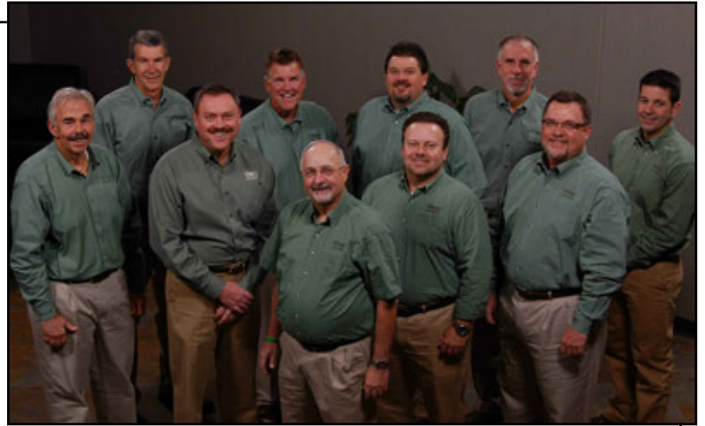
Our Executive Management team

The company continues to plan for growth and expansion, projecting the addition of 200 new locations in 2014.